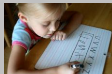
PROMOTES KINDERGARTEN READINESS