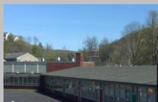
LOCATED AT LINCOLN SCHOOL